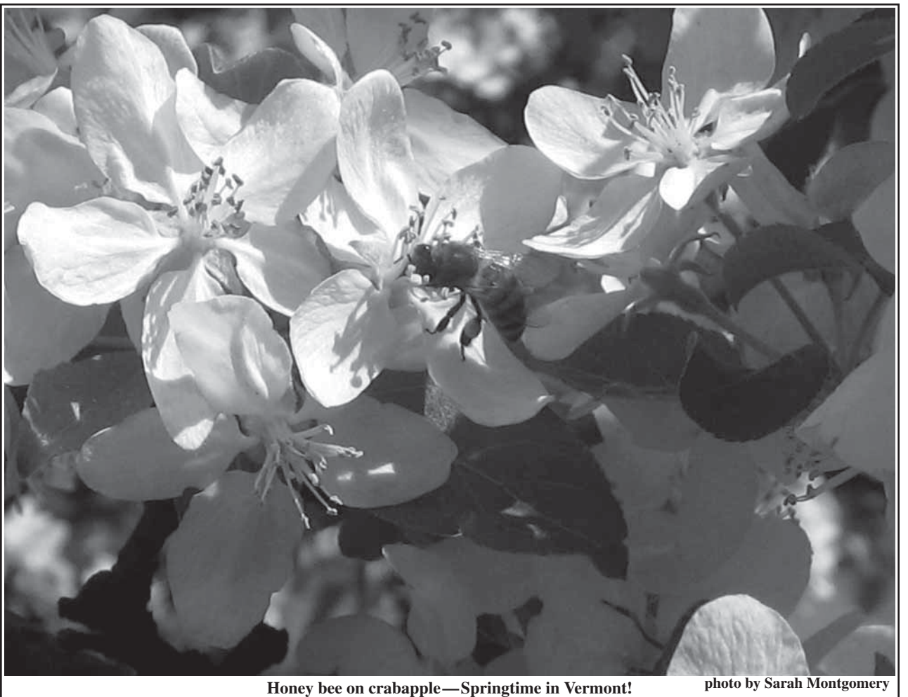
Honey bee on crabapple—Springtime in Vermont!

Route 5, Exit 15 off I-91, Fairlee, VT www.boatingvermont.com (800) 287-9745