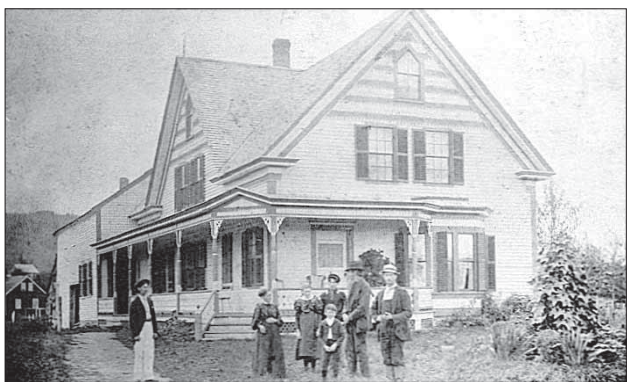
Silver Maple Lodge Circa 1920